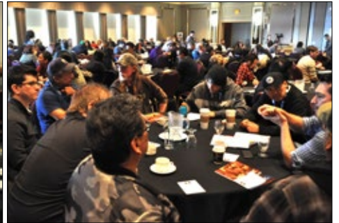
FNH Conference 2019