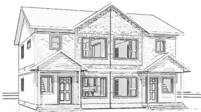
IFNA Student Housing – 3D front View